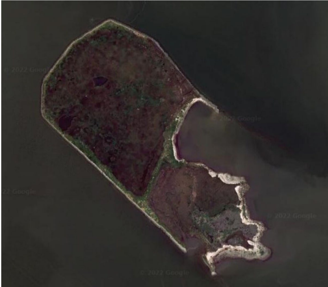
Figure 1. Terrebonne HNC Island. Terrebonne Parish, Louisiana.

construction, the island may be planted with suitable vegetative species (e.g., Iva, Baccharis, Lycium, Avicennia) to provide optimal nesting substrate. (Figure 2).