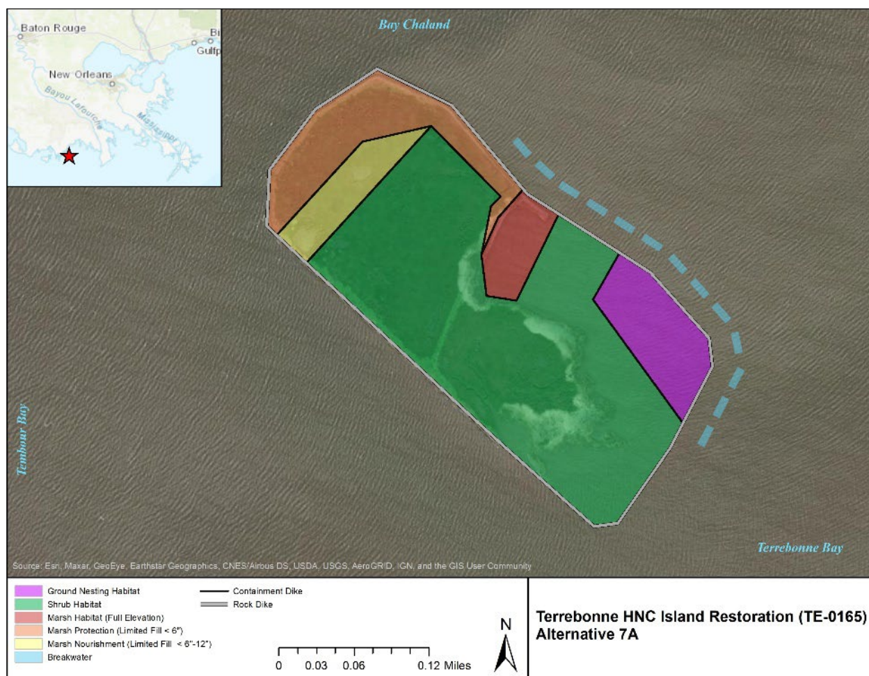
Figure 3-1. Features of Design Alternative 7A.