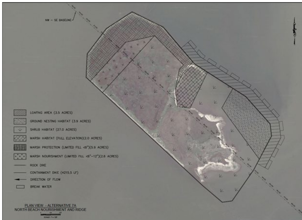
Figure 2. Proposed Restoration Design for Terrebonne HNC Island.

The Project is being implemented as restoration for the DWH oil spill NRDA, consistent with the Deepwater Horizon Oil Spill: Final Programmatic Damage Assessment and Restoration Plan and Final Programmatic Environmental Impact Statement and the Deepwater Horizon Oil Spill Natural Resource Damage Assessment Strategic Framework for Bird Restoration Activities (the Framework).